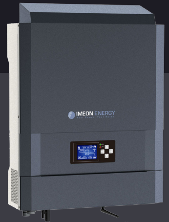
IMEON 3.6 Up to 4kWp Single phase