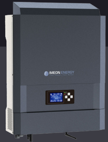
IMEON 3.6 Up to 4kWp Single phase