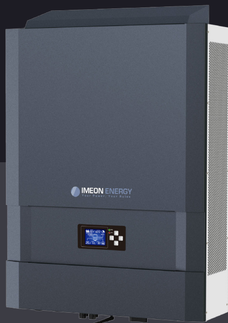
IMEON 9.12 Up to 12kWp Three phase